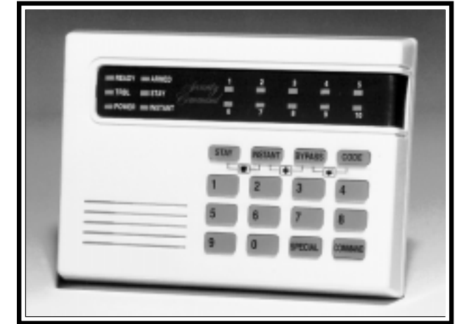
The Security Command Keypad

Tomorrow's technology for today's security needs.